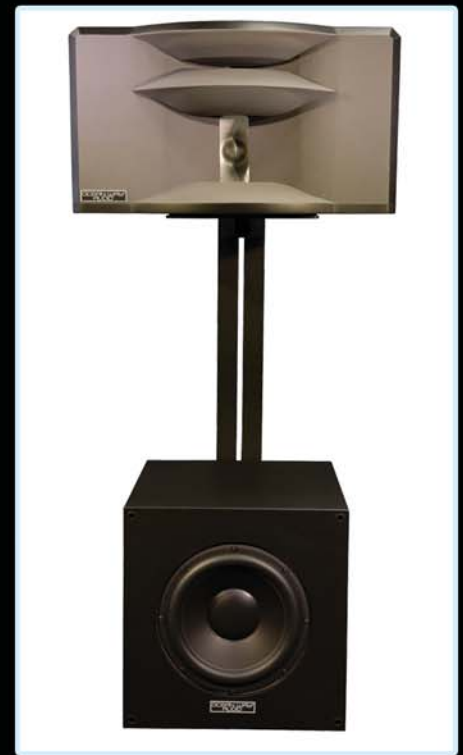
Right: HR4S with S12A Mk II Subwoofer (stand sold separately).

Ocean Way Audio has released an accurate, wide dynamic range reference monitor for the recording studio environment. The HR4 Reference Monitor is a 24", integrated 2-way dual-horn system that can be placed in any environment to provide an exceptionally accurate monitoring experience.